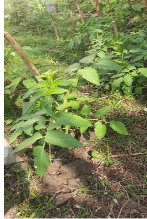
Plants yielding vegetables in Kitchen Garden