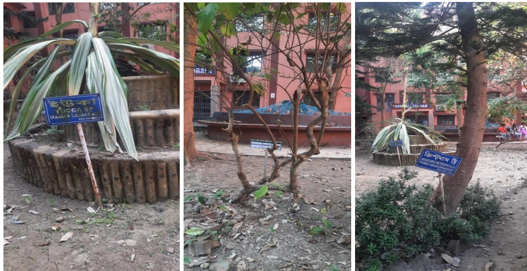
Plants inside the College campus