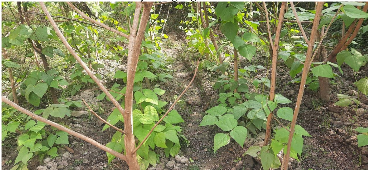
Kitchen Garden plot