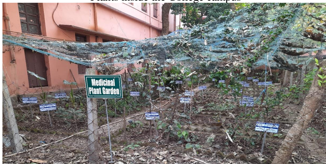
Medicinal garden of wild plants with medicinal values