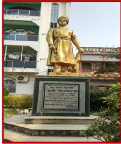
Swami Vivekananda in College Campus