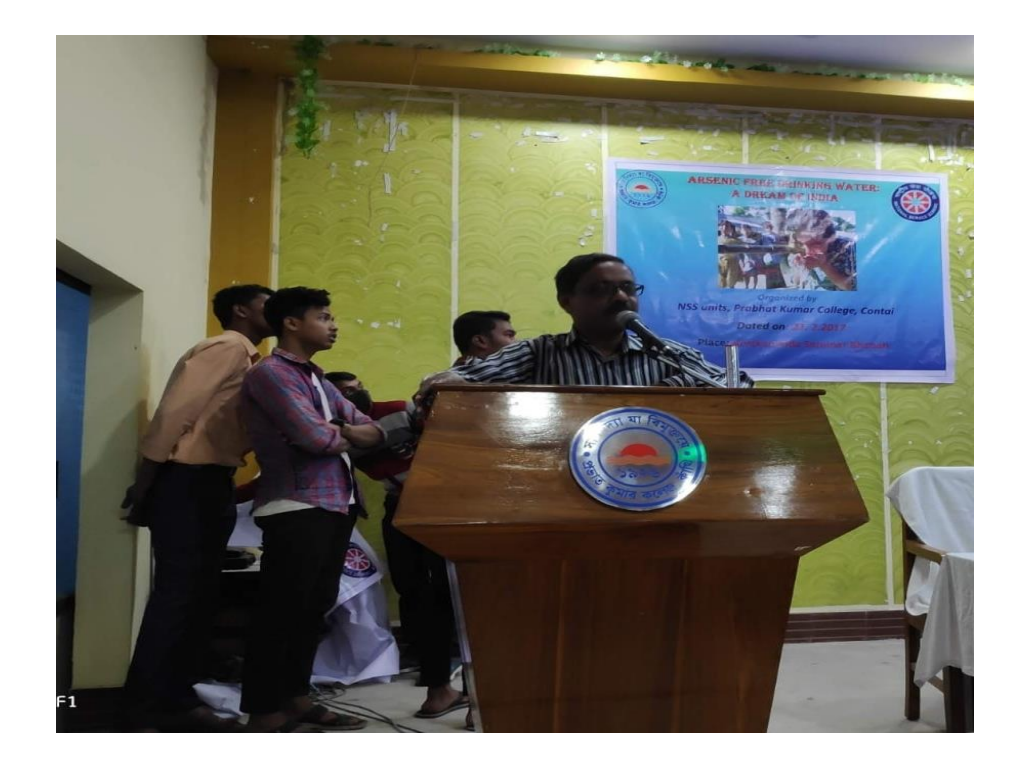
Discussion among the expart of Swasthya Bhabna and studens on 23<sup>rd</sup> February, 2017.