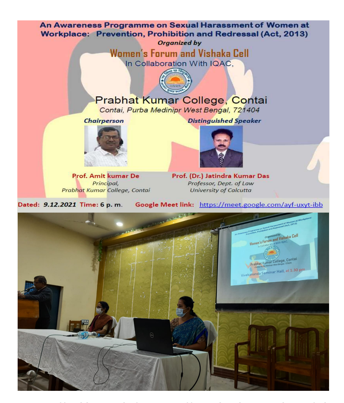
AN AWARENESS PROGRAMME ON SEXUAL HARASSMENT OF WOMEN IN WORK PLACE ON 9.12.21