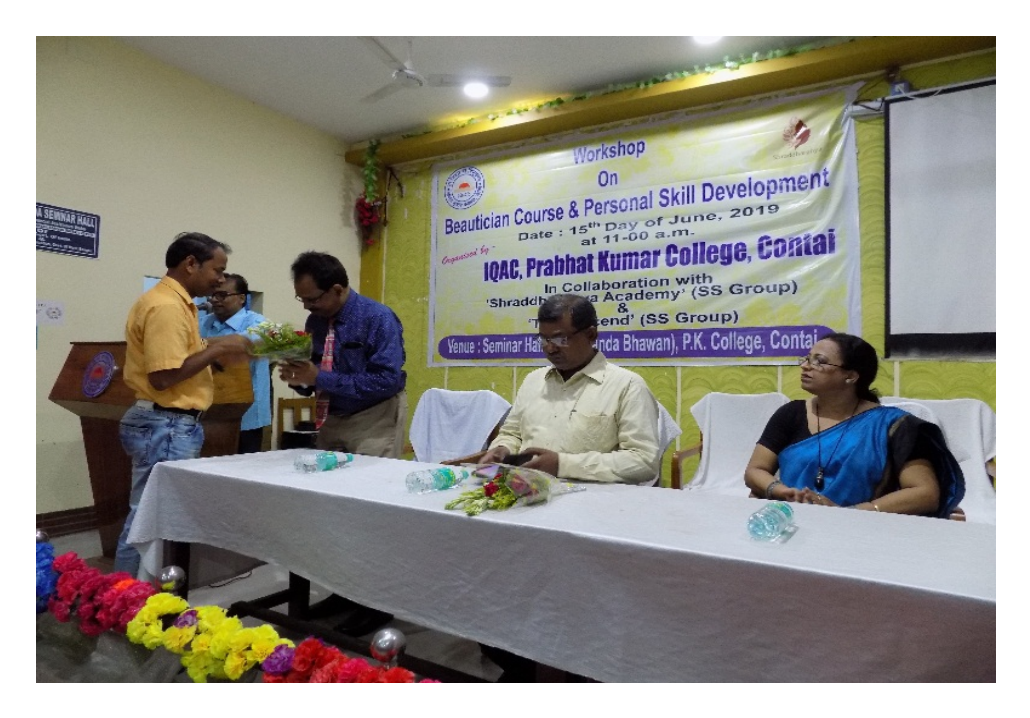
SKILL DEVELOPMENT WORKSHOP FOR FEMALE STUDENTS on 15.6.19