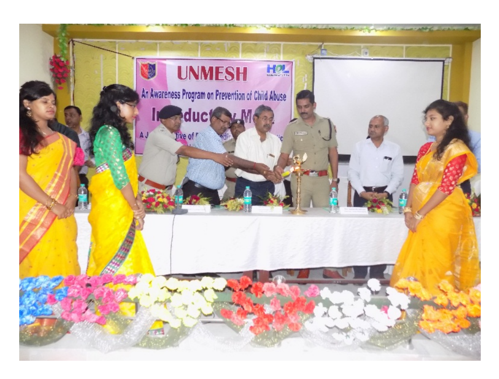
AWARENESS PROGRAMME ON CHILD ABUSE on 17.8.18