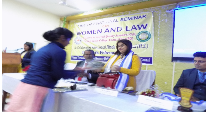
ONE DAY NATIONAL SEMINAR ON WOMEN'S AND LAW ON 4.02.20