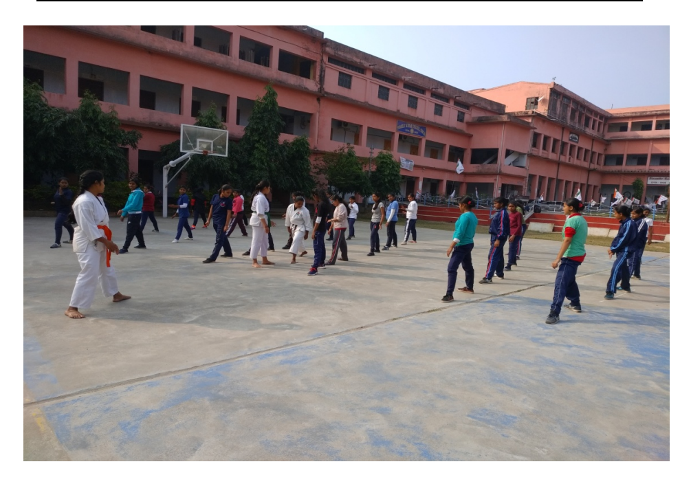
SELF DEFENSE PROGRAMME FOR WOMEN