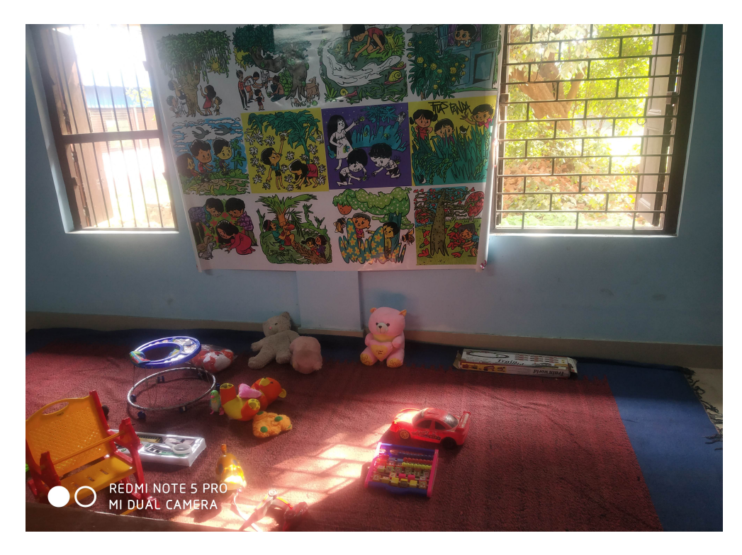
DAY CARE CENTRE OF OUR INSTITUTION