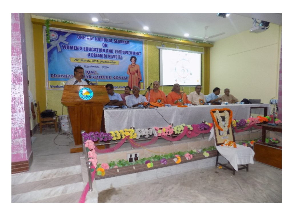
COMMEMORATE THE CONTRIBUTION OF NIVEDITA TOWARDS INDIA ON RHR 100^{\text{TH}} YEAR BIRTHDAY: A ELABORATE DISCUSSION ON WOMEN'S EMPOWERMENT ON 28.3.18